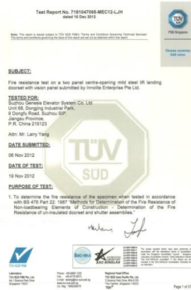
E-121 certification (Singapore)