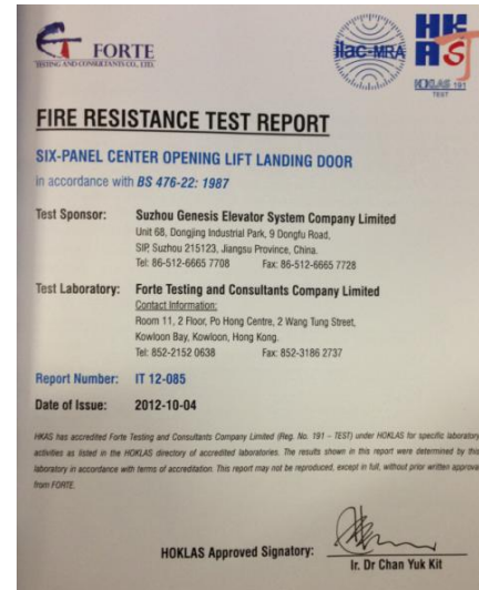
BS476-22 E160 certification