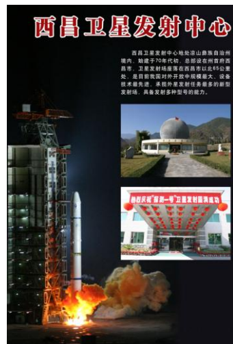
Xichang Satellite Launch Center