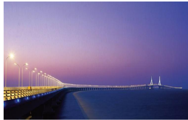
Hangzhou Bay Bridge