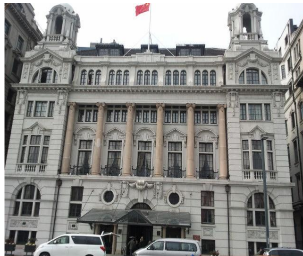
Waldorf Astoria Hotel