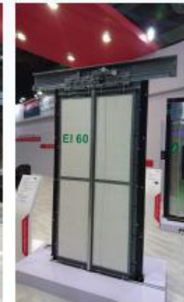
GENESIS FIRE- RATED DOORS E120, E30/EI30, E160