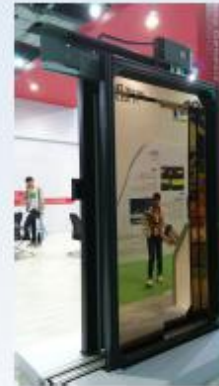
GDO DC SERVO DRIVEN