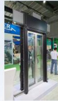
GDK AC SERVO DRIVEN